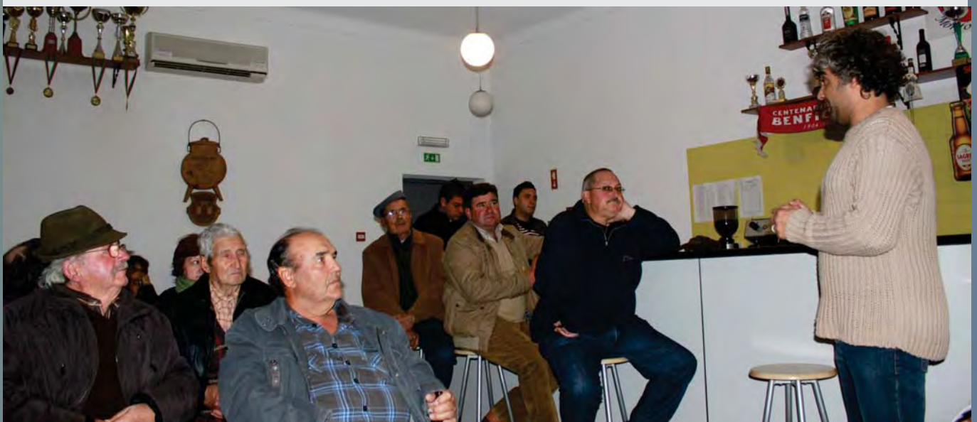
29 November – Cycle of public presentation of mining movies heads towards Monfortinho. The document which portrays the history of the gold mining prospection in the region of Termas de Monfortinho was introduced in the village of Monfortinho, at the local association.